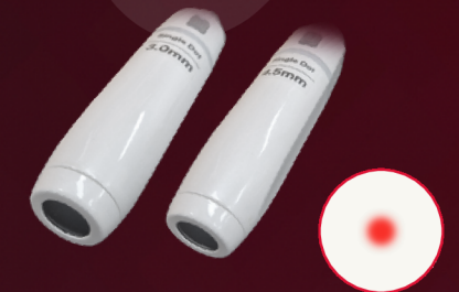
Dot HiFU Handpiece