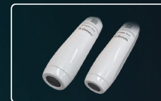
Dot HiFU Handpiece