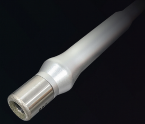
Diamond Peel Handpiece