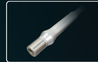
Diamond Peel Handpiece