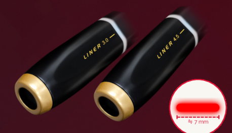
Liner HiFU Handpiece