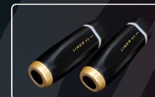
Liner HiFU Handpiece*