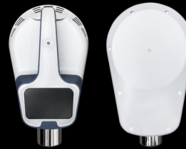
Curved Applicator for arm or curved areas