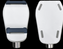
Flat Applicator for abdomen

ORCHESTRA MAX offers a total of four applicators, specifically designed with two for the abdomen and two for curved areas such as the arms. These applicators can be utilized simultaneously, allowing for efficient treatment and time-saving benefits.